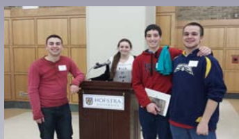
The Varsity Leaders Club members at Hofstra University for the 12th annual Student Athletes as School Leaders: Leadership On and Off the Field

On Tuesday, March 3 rd , Plainview-Old Bethpage High School students from our Varsity Leaders Club Program were chosen to participate in a leadership event at Hofstra University. The 12th Annual Student Athletes as School Leaders: Leadership On and Off the Field is an informative event sponsored by our Nassau County High School Principals’ Association, our Physical Education Consortium, and Hofstra’s School of Education. It has been an event our Plainview-Old Bethpage students have been apart of for the past 10 years.